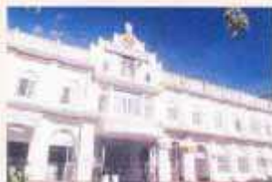
Fr. Muller Hospital