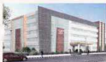
Lady Goshen Hospital, Mangalore