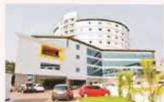
Indiana Hospital, Mangalore