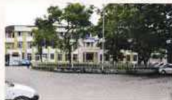
Govt. Wenlock Hospital, Mangalore