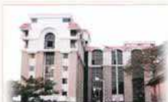
Omega Hospital, Mangalore